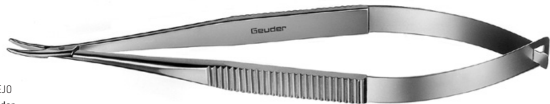
CASTROVIEJO Needle Holder 10.5 mm delicate jaws 1.5 x 0.8 mm tips overall length 140 mm curved, without lock curved, with lock