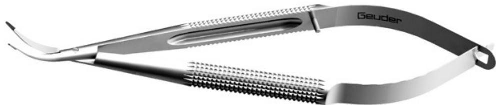
Combined Needle Holder/ Scissors curved 12 mm blades with 3 mm needle holder and tying platform used to hold, place and cut fine suture material overall length 125 mm