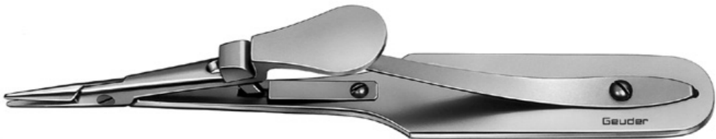
ARRUGA Needle Holder straight one jaw smooth other serrated 14 mm heavy jaws thumb rest and catch overall length 140 mm