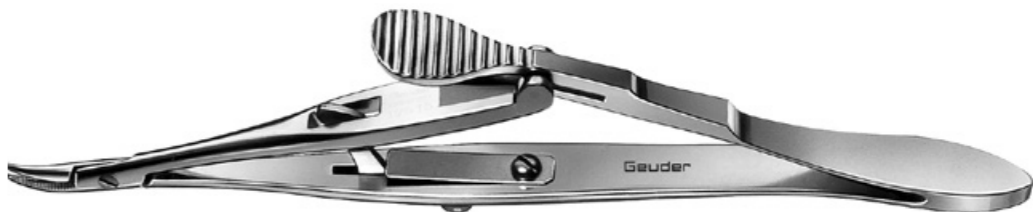
KALT Needle Holder standard jaws serrated, with longitudinal groove thumb rest and catch overall length 135 mm straight, cross serrated jaws curved, cross serrated jaws