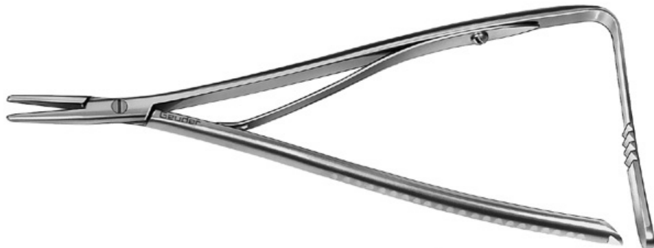
HEIDELBERG MODEL Needle Holder straight 14 mm heavy jaws with ratchet lock overall length 125 mm